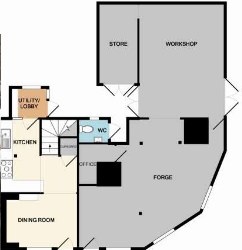
GROUND FLOOR APPROX. FLOOR AREA 1025 SQ.FT. (95.2 SQ.M.)

STORE ROOM 13'2" x 6'6" (4.01m x 1.98m). Double doors to courtyard.